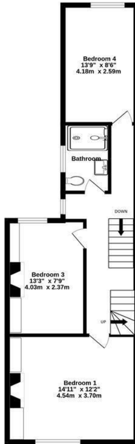
1ST FLOOR 562 sq.ft. (52.2 sq.m.) approx.